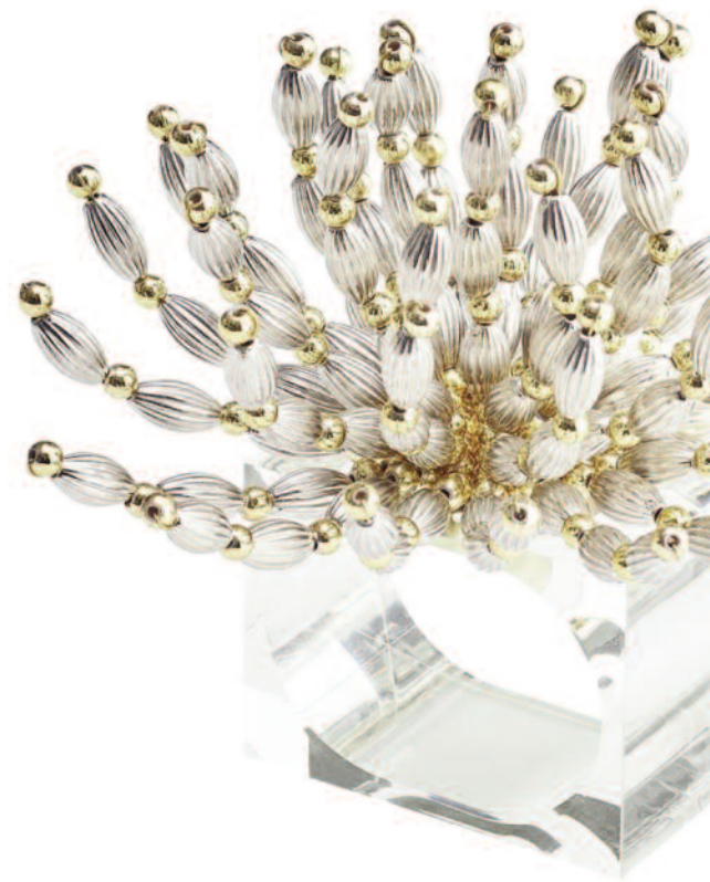
Bead Burst Napkin Ring by Kim Seybert features textured beads finished with metallic caps which are hand- arranged atop an acrylic base, mimicking an organic spray. Available through Main Dish in Scottsdale.