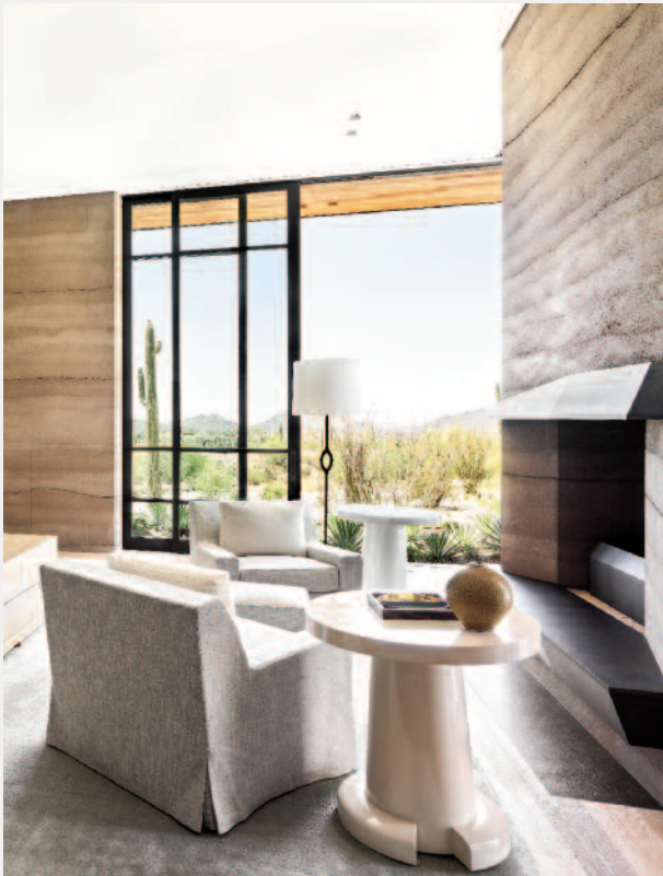
ARCHITECTURE: CP DREWETT . DREWETT WORKS CONSTRUCTION: DESERT STAR CONSTRUCTION